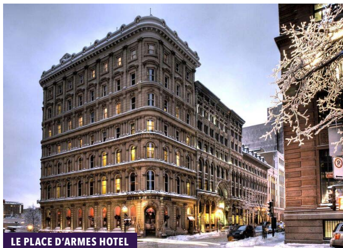
LE PLACE D'ARMES HOTEL