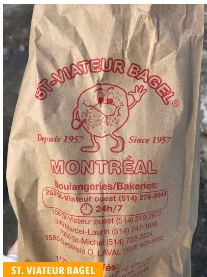
ST. VIATEUR BAGEL